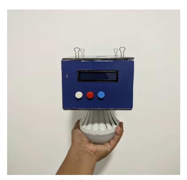
Fig. 3. The AUDI System.

During the experiment, the chicks were given the same amount of food and water under traditional lighting (TL), LED lighting system (LL), and the i-Light system. Based on Table II, the i-Light system's gain during week one is 48.68% heavier than the TL at the same time it is 17.65% heavier than the LL. Based on the data collected during Week 2, the effectiveness of the i-Light system was once again demonstrated. During that week, the growth was 37.97 grams, compared to only 19.91 grams with TL and 12.89g with LL. This implies a 47.56% difference with TL and a 66.05% difference with LL.